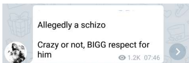
Members of a Far-Right extremist chat on Telegram commenting on the Hanau attack (1).