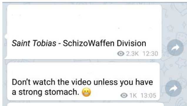
Members of a Far-Right extremist chat on Telegram commenting on the Hanau attack (2).

Examining the manifesto-like letter and the videos more in detail, several characteristics emerge that resemble previous right-wing extremist motivated attacks and point towards an international trend.