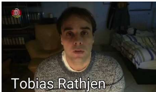
Screenshot of the self-recorded video of Tobias Rathjen reposted on a German Far-Right extremist channel on Telegram.

He then continues by linking non-white ethnic groups to provocative behaviour, physical attacks, knife attacks leading to serious injuries or deaths and a general increase of crimes in Germany. This narrative is often used by far-right or white supremacist extremists, who routinely blame migrants, particularly those from developing countries, for an increase in nationals’ crime rates. To support their claim, far-right extremists also make use of distorted figures and numbers to underline the threat of migrants and certain ethnic groups. From the analysis of one of his self-recorded videos which have been taken down from YouTube shortly after the attack, it appears that Rathjen aims at reinforcing the anti-migrant narrative by claiming that at present, every day one German national is being killed by a migrant.